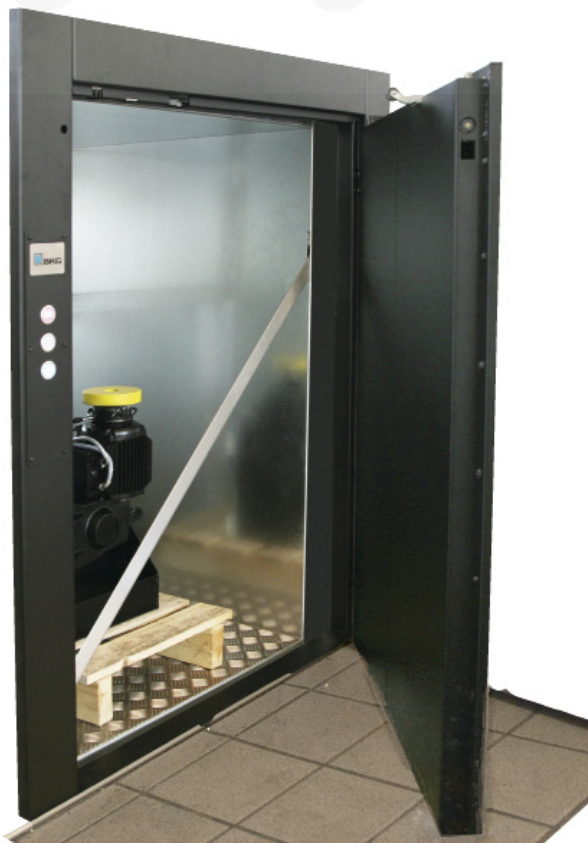
Hinged door with drop bar